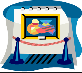
Exhibit Registration Form AL-APSE & ACDD 2012 Step into the Future... Employment Fits!!! July 25 - 27, 2012