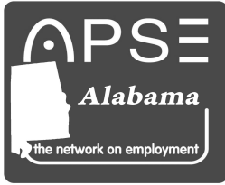
Exhibit Registration Form AL-APSE & ACDD A New Decade of Success June 24 - 25, 2010